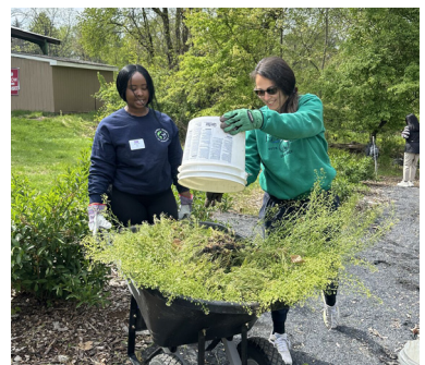
SPW volunteers getting hands-on with gardening and weeding to help beautify the campus